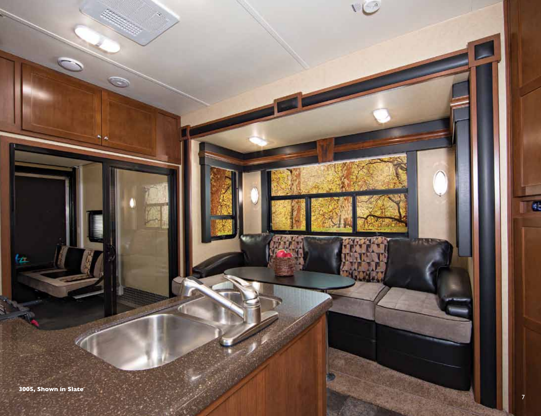
3005, Shown in Slate