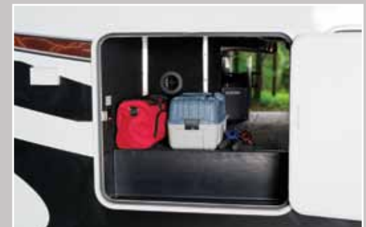
3895 Pass Thru Storage