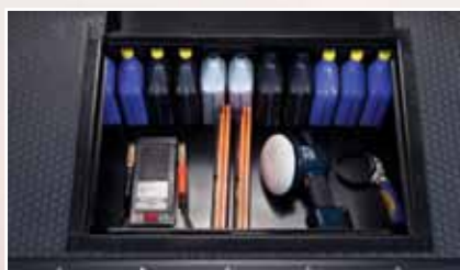
DOVETAIL STORAGE BOX