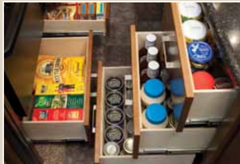
FULL EXTENSION DRAWER GLIDES

Kitchens are a pleasure to prepare meals in, and Voltage offers storage opportunities everywhere.