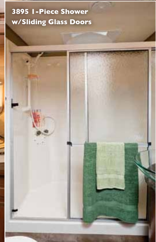
3895 I-Piece Shower w/Sliding Glass Doors