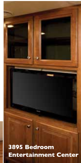
3895 Bedroom Entertainment Center

Voltage executive bedrooms offer an incredible amount of spaciousness. Puff up your pillows, sink into our full-sized residential mattress, flip on one of several reading lights, crack open that book you've been dying to start and relax! Other features include 120V outlets on each side, generous storage areas, adult-sized mirrors and huge wardrobes.