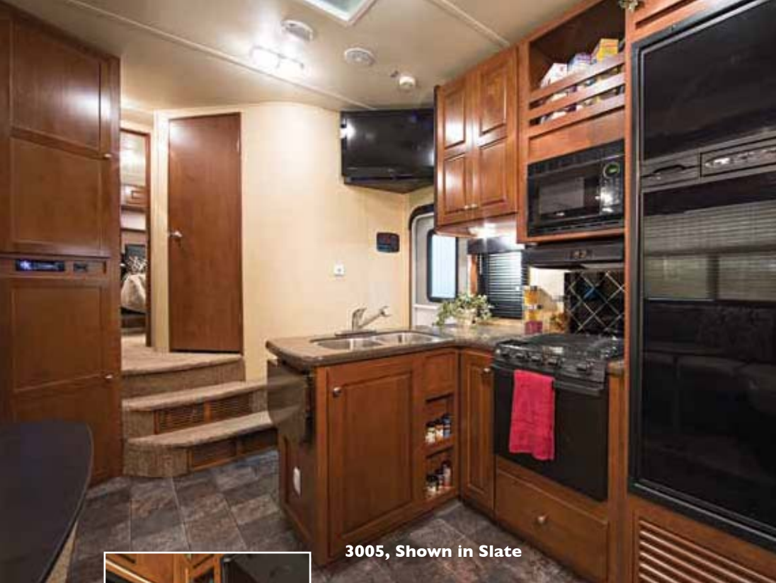
3005, Shown in Slate