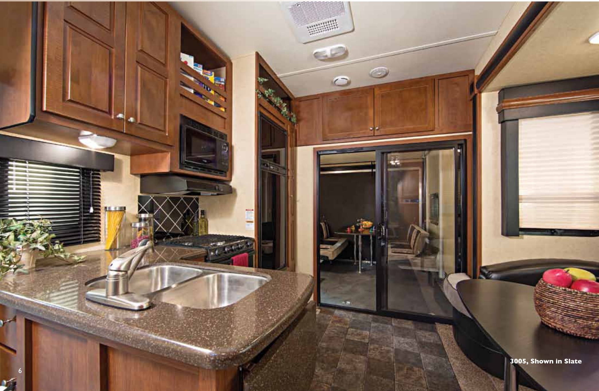
3005, Shown in Slate

Voltage V-Series toy haulers offer a whole lot of trailer for the money. We give you all the necessities and conveniences of home, including solid surface countertops, comfy furniture with storage features, quality kitchen appliances, stainless steel double-bowl sink, and well-designed storage areas.