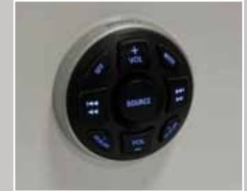
3895 Exterior Sound Control