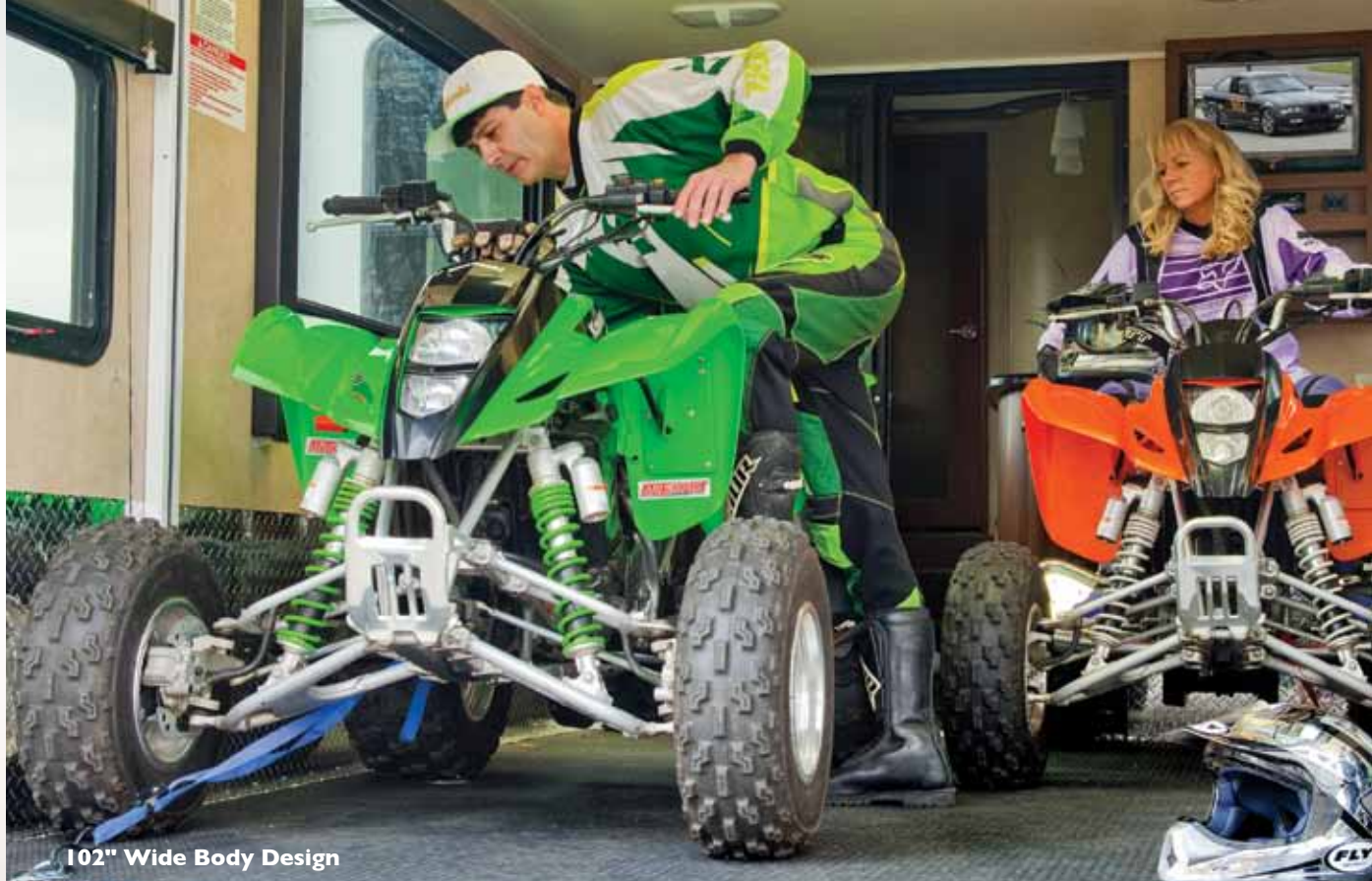
102" Wide Body Design

Non-slip chemical and UV resistant Tuff-Ply flooring, 2,500-pound tie-down rings, 22" diamond plate, heat and AC ducts, and metal ram-air vents are all standard features.