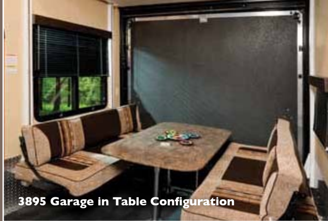
3895 Garage in Table Configuration