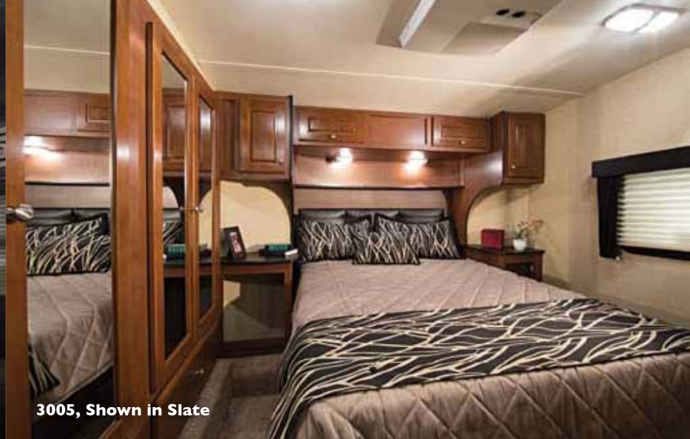
3005, Shown in Slate

Bedrooms offer serenity and space. Our engineers utilized the entire depth and width of the front cap area for increased bedroom square footage. Not only does this make for a beautiful and restive space, but you'll be amazed at the amount of storage it allows.