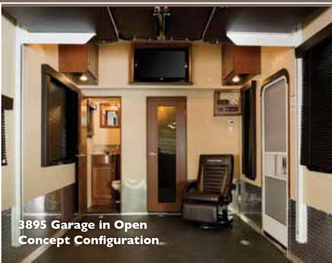
3895 Garage in Open Concept Configuration