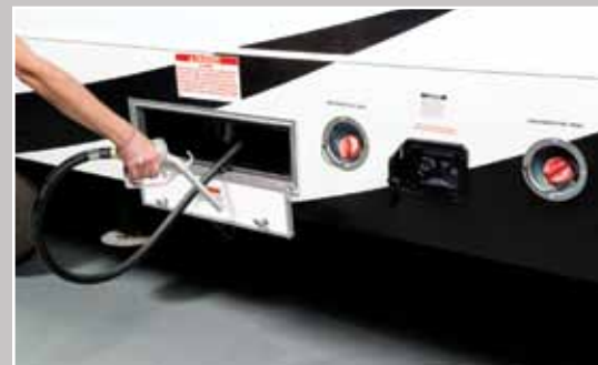
3895 Fueling Area