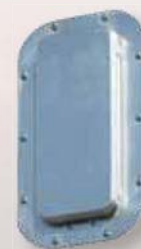
DUAL RAM-AIR CARGO VENTS