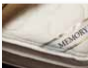
Residential Memory Foam Mattress