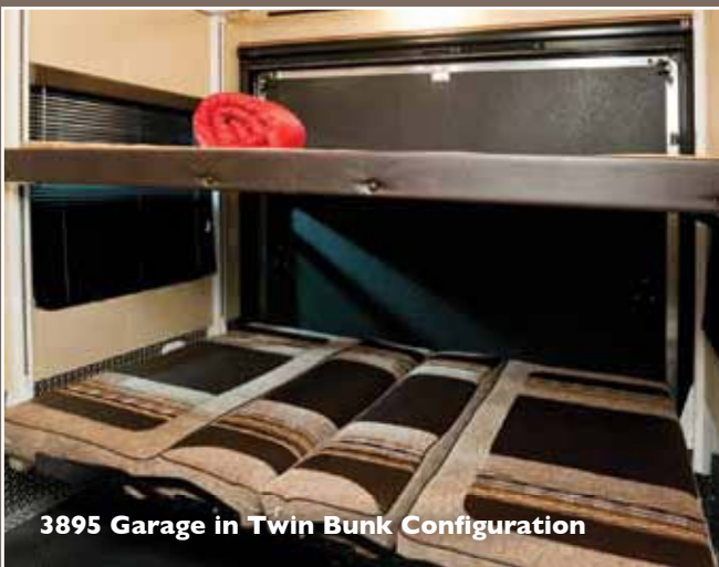
3895 Garage in Twin Bunk Configuration