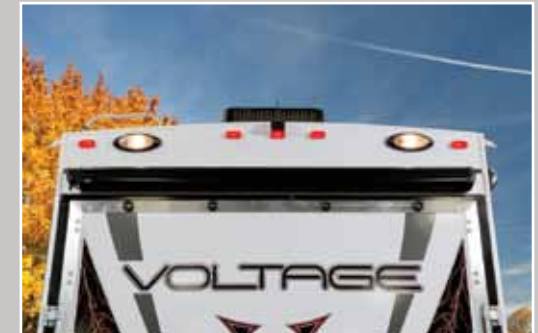
3895 Rear Camera and Lights