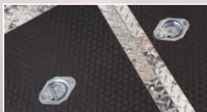
2,500 LB FLUSH FLOOR TIE-DOWN RINGS