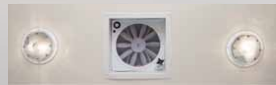
CARGO AREA POWER FAN