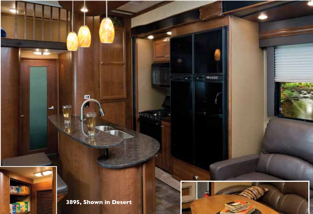
3895, Shown in Desert

Voltage toy haulers are designed, developed and produced by professionals who not only take pride in their work, but actually care about their customer's experiences when using our products! Your family and friends will move seamlessly from room to room and activity to activity because of the time we've spent planning the use and flow of each space.