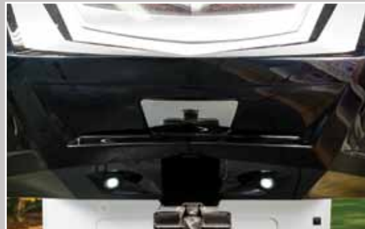
3895 Exterior Docking Lights